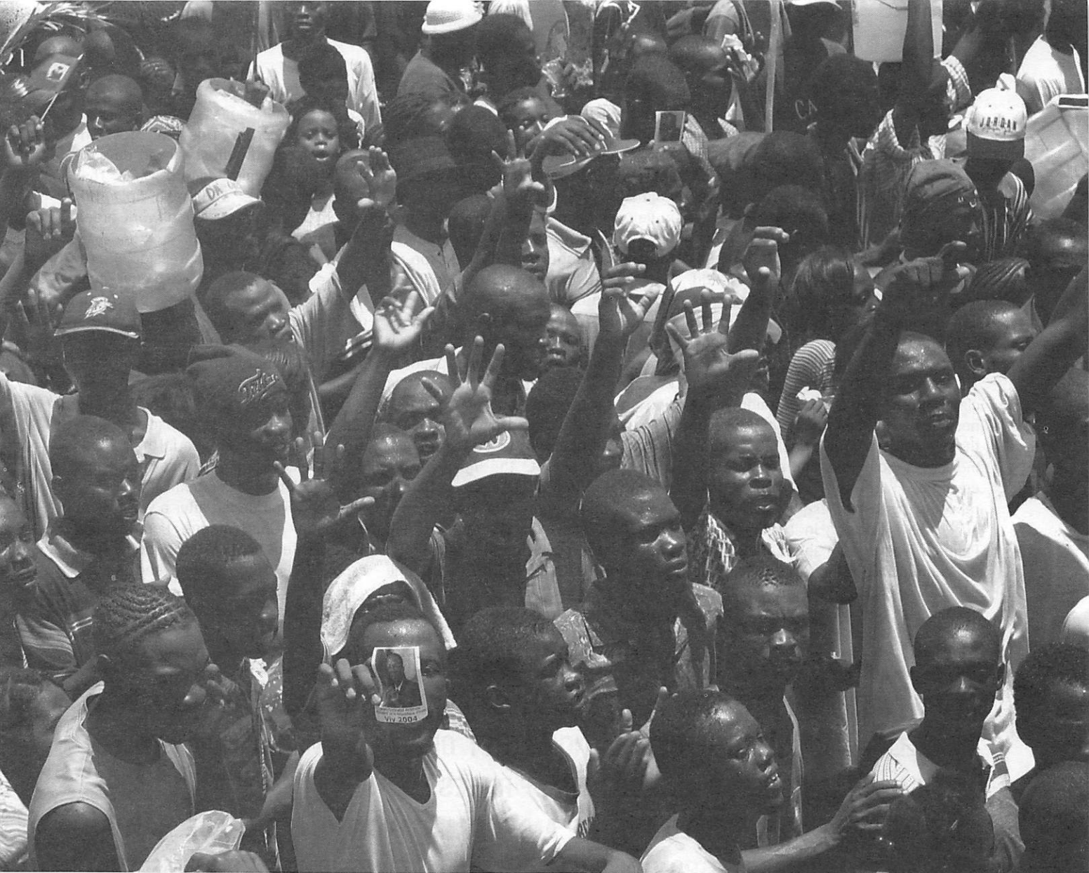
Pro-President Aristide demonstration in Haiti, 2004.